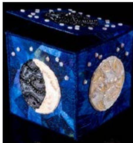
Phases of the Moon fabric and beads 5"x5"x5"

Upper right corner: Tree House I fabric and beads 4"x15"x4"