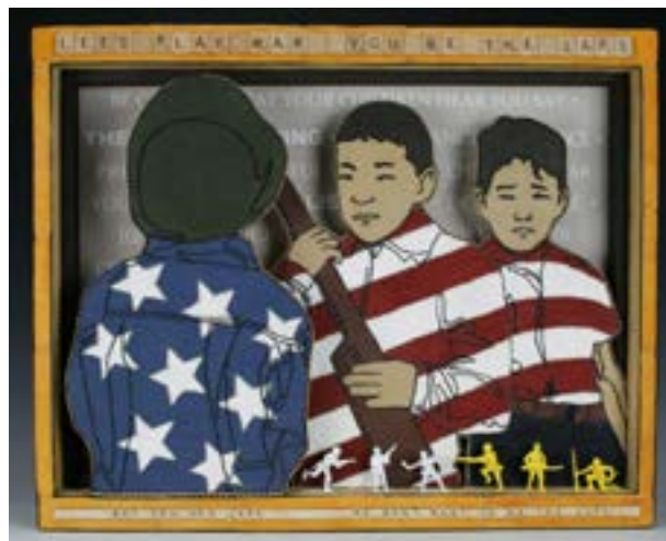
Out of the Mouths of Babes (Japanese American Internment Series), 19" x 24"

2012. Grapefruit peel, cantaloupe peel, ginkgo leaves, ostrich shell beads, cedar bark, hydrangea petals, lunaria seed pods and waxed linen.