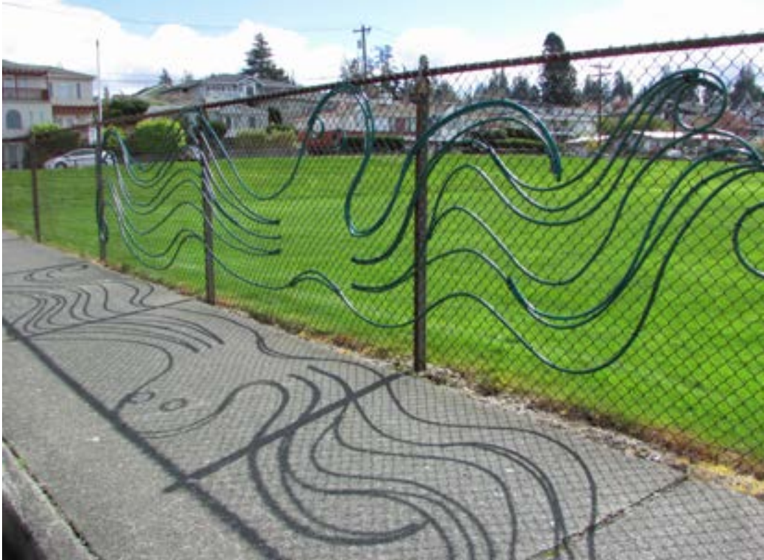
Liberated Octopus 300" W x 70" H

Naoko Morisawa's new installation for the City of Edmonds is installed at Main St and 8th Ave. It was commissioned by the City of Edmonds and Edmonds Parks and Recreation.