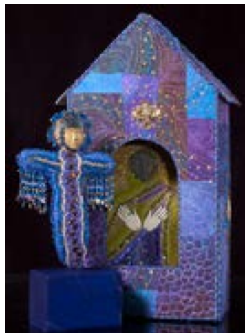
The Mentor , fabric and beads 7"x12"x4"