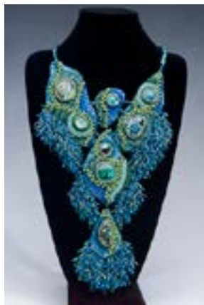
Cordelia: Jewel of the Sea bead embroidery 7"x11"x1"