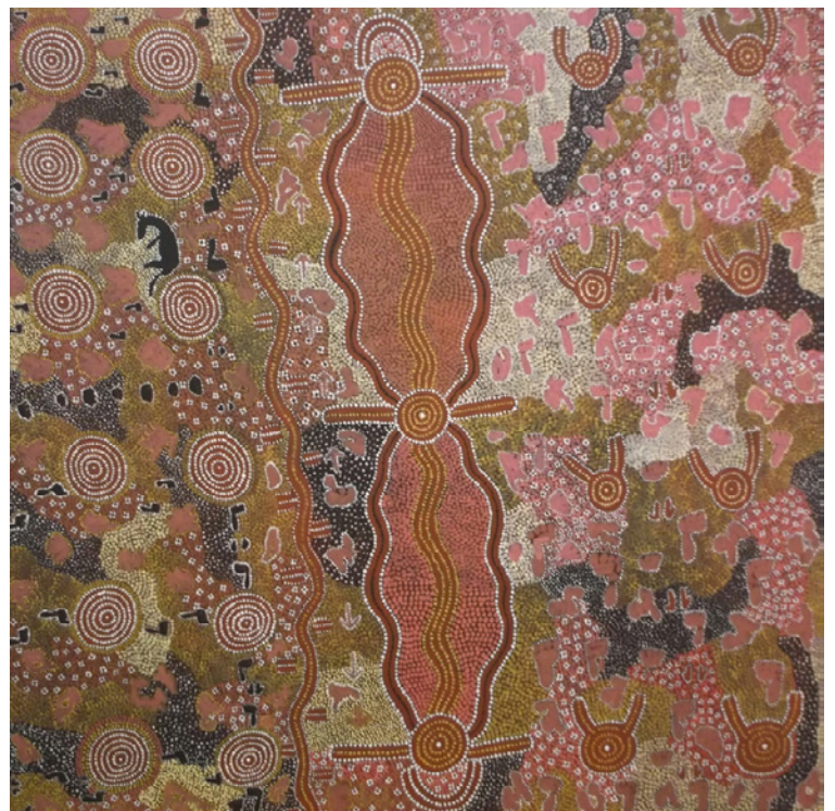
Above: Water and Wallaby by Dick Pautimus Tjupurrula, 1981. Acrylic on linen, 4' x 4'

They most probably also have hidden meanings, disguised from non-Aboriginal eyes to preserve the sacred significance behind their maps and totem figures. Or maybe they should just exist along with other world art as superb examples of Abstraction Expressionism.