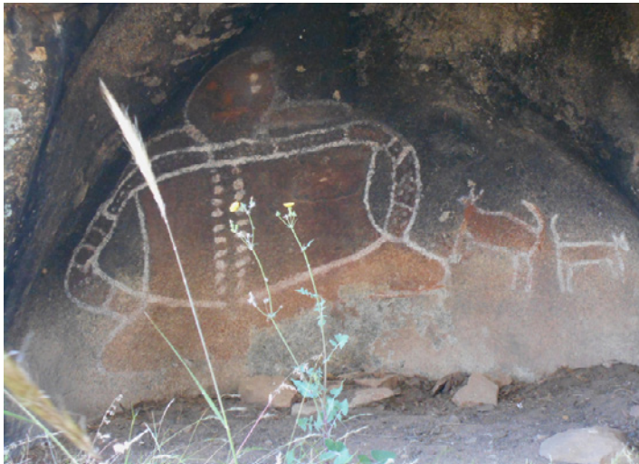
Above: A 4' tall Bunjil, the Creator, and his two dog-brother assistants. (Brambuk Cultural Center, The Grampians –Geriwerd Tribe- National Park, Hall's Gap, Victoria, AUS)

As in most cultures, Australian artists – both Aboriginal and non-Aboriginal - tell stories of their physical, environmental and cultural histories. While in Australia for the past 3 months on an art sabbatical, I assembled an intriguing personal compilation of their histories, selected by their dominant cultural representatives, by my own predilections, and by chance.