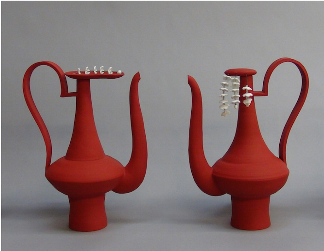
Lois Harbaugh, Ewer Study , 2015 terra cotta vessels, high fire porcelain flowers, 13” h x 22” w x 7” d

“I am interested in the vessel: all its myriad shapes, its status as iconic symbol, and its role as carrier of cultural information.