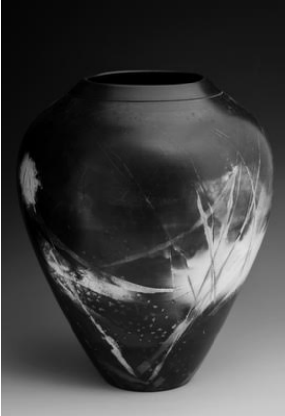
Ruth E. Allan Lightening Bound Sagger-fired, wheel thrown porcelain 15”h x 12” w