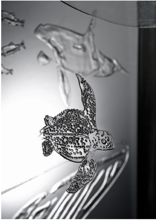
Detail of Reliquary .