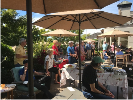
NWDC members at the annual summer social.