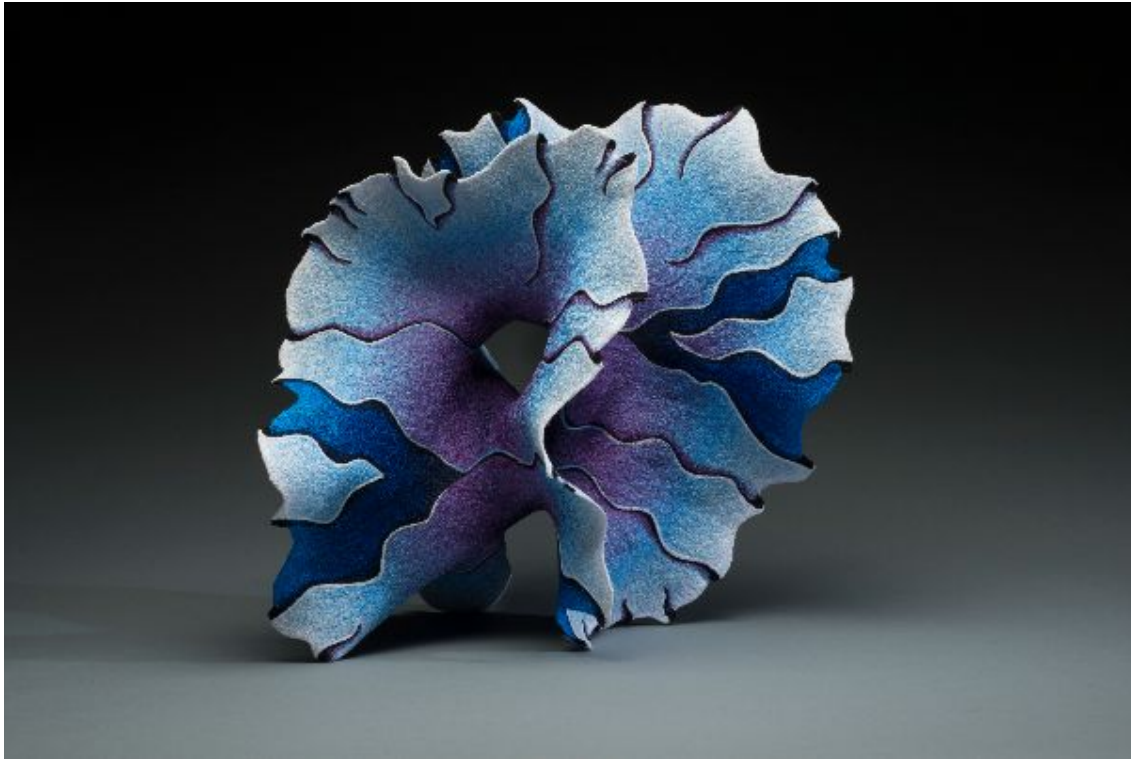
Image: If you fall off the edge of the island, something nice that lives underneath will catch you and put you back on top , Tin, 48 x 24 x 18 in.

You can also see a short video at www.vimeo.com/kr3d and sign up for Kathy Ross's monthly email newsletter at www.krtins.com