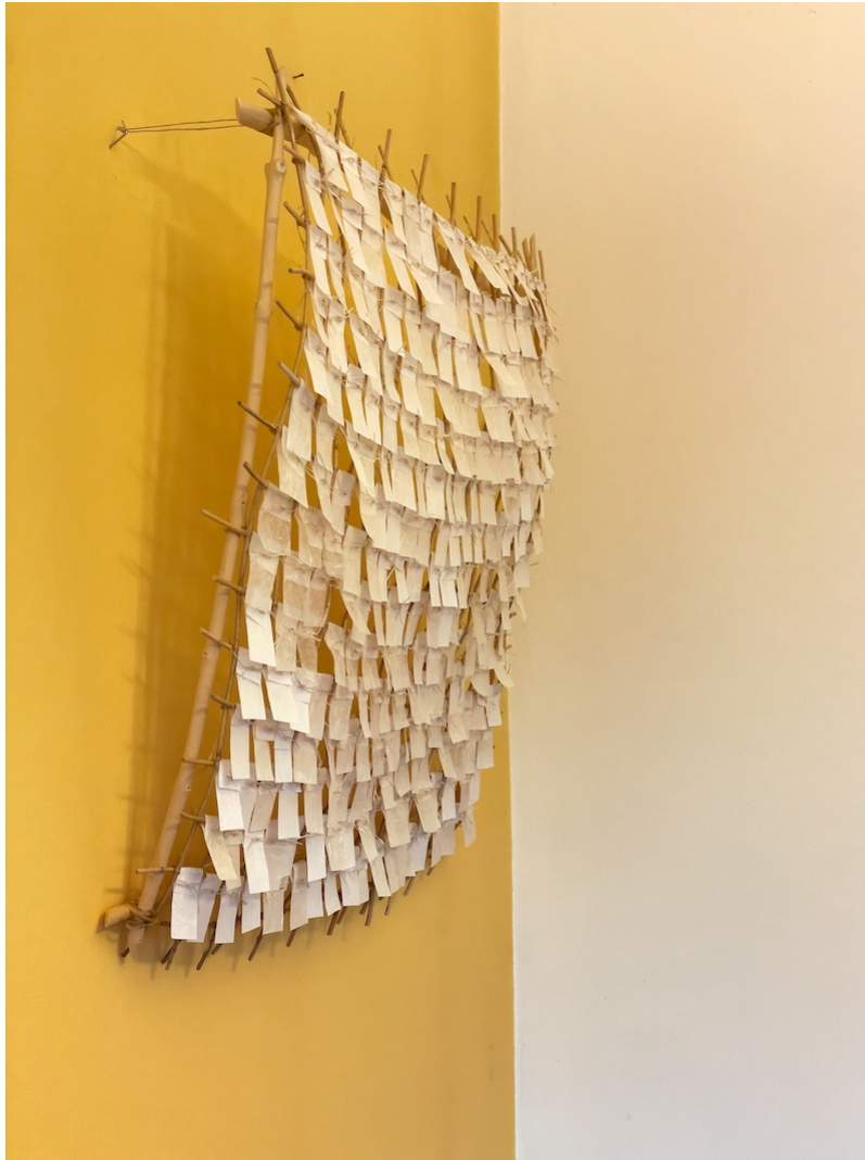
Denise Snyder Many Tranquil Moments 26 x 29 x 4" Rattan Vine, handmade paper, found wood, linen