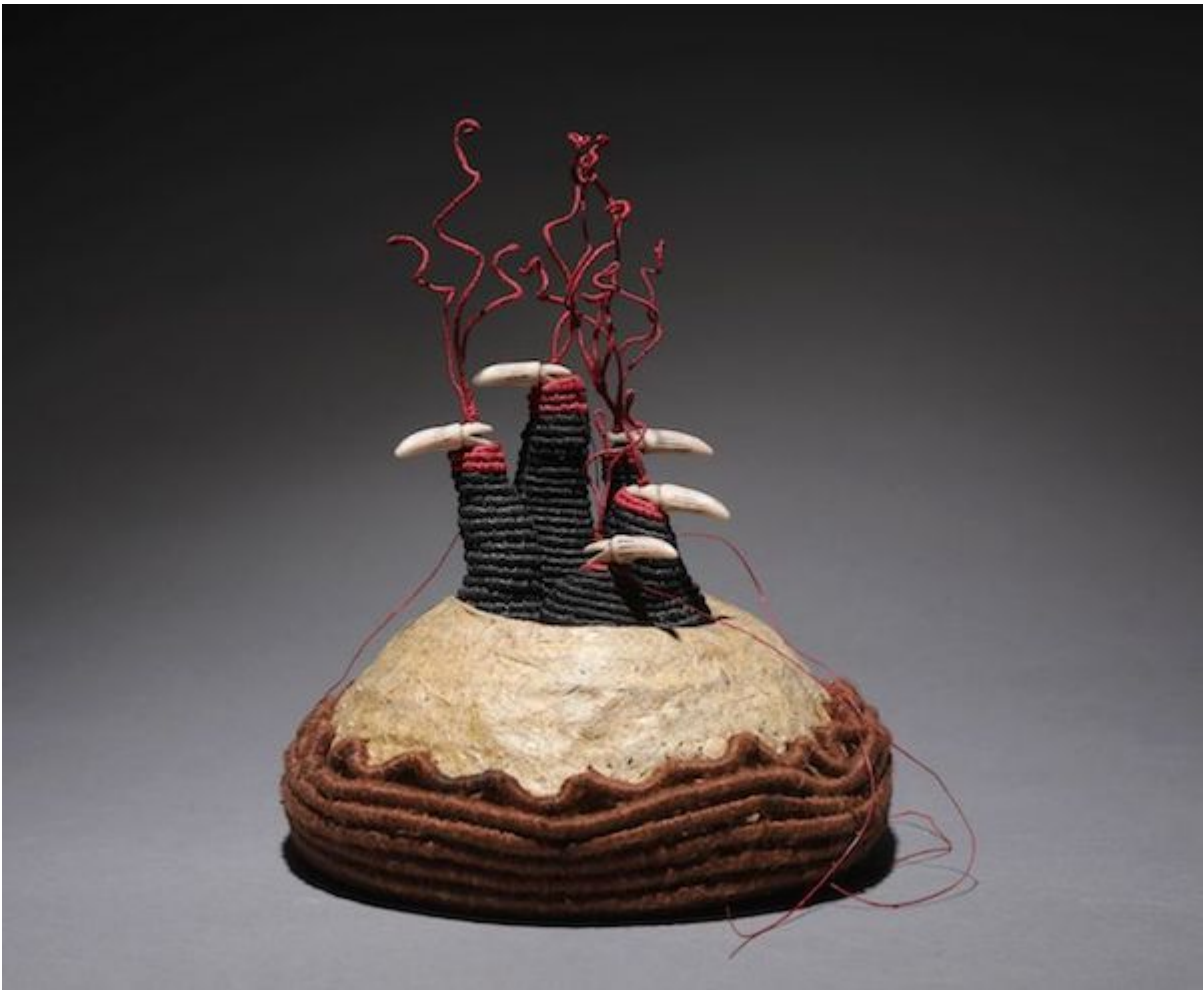
Danielle Bodine Four and Twenty Black Birds Baked in a Pie Coiled linen, cast mulberry paper, bone beads, wire