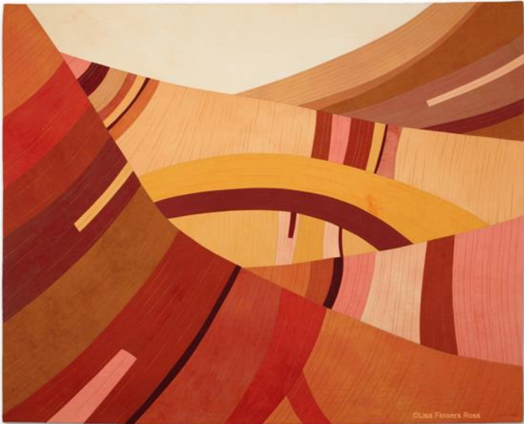
Lisa Flowers Ross Field Study (U1Z1) hand dyed fabrics, thread 39-1/2" x 49"