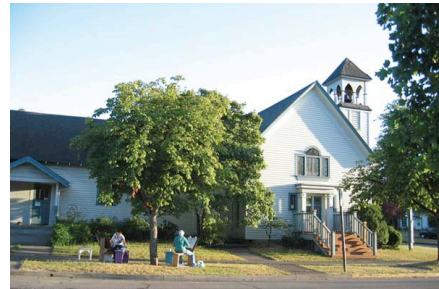
Maude Kerns Art Center

Artist Opening: May 25, 2012 6:00 pm – 8:00 pm