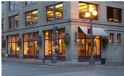
Northwest Fine Woodworking

NWDC – NCECA NW Gallery of Fine Woodworking 101 S. Jackson Seattle, WA 98104 www.nwfinewoodworking.com 206 625-0542