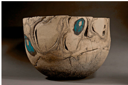
BETH WYATT, "Reflections of Crane and Tortoise"

In April, MUSEO gallery, Langley WA will welcome the spring season with their annual garden show entitled "Through The Garden Gate". The gallery will be filled with botanical themed paintings, vases, outdoor garden sculptures, containers - all things garden. Opening Reception - First Saturday, April 2 from 5 to 7 pm. NWDC artists include BETH WYATT, showing a carved midrange stoneware cachepot, 16" in diameter, entitled "Reflections of Crane and Tortoise".