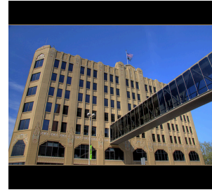
Spokane City Hall