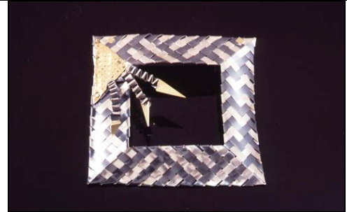
This braided brooch by Arline Fisch incorporates the techniques you will be learning in this workshop.

WOVEN and PLAITED STRUCTURES in METAL SAT & SUN, May 21 & 22, 2011 9:00 AM to 5 PM Workshop Fee: $225.00 Max. Materials Fee: $ 35.00 Class Size: Min. 8 / Max 20-25