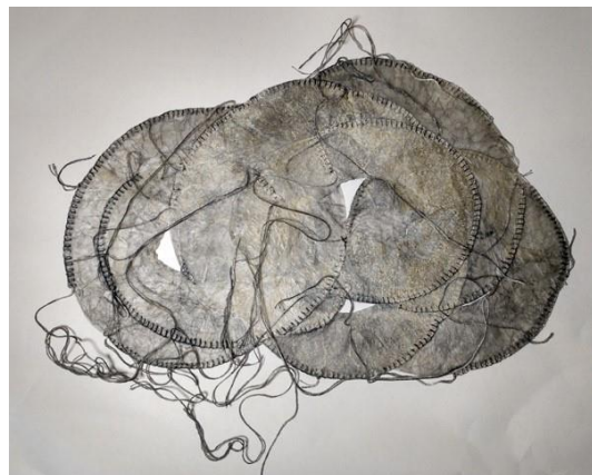
Arisa Brown Untitled , 2018, pig gut, ink, thread 11" x 16"